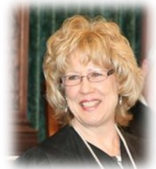
Oklahoma Supreme Court Justice