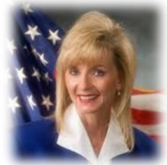
Oklahoma Corporation Commissioner