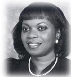
Chief U.S. District Judge for the Western District of Oklahoma