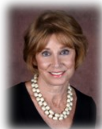
Oklahoma Court of Criminal Appeals Judge