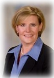
Oklahoma Corporation Commissioner