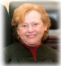
Oklahoma Court of Criminal Appeals

These photos represent nine very important, trailblazing women leaders in Oklahoma's government. They have important roles and make key decisions that impact all Oklahomans. See if you can recognize them by drawing a line to match their faces with their names.