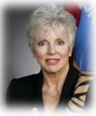
Secretary of Veteran Affairs

These photos represent nine very important, trailblazing women leaders in Oklahoma's government. They have important roles and make key decisions that impact all Oklahomans. See if you can recognize them by drawing a line to match their faces with their names.