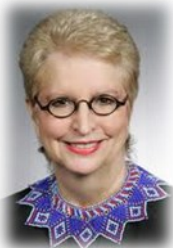
Oklahoma Supreme Court Justice