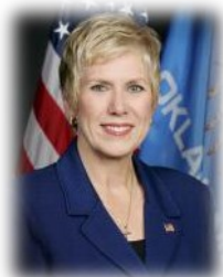
State Superintendent of Public Instruction